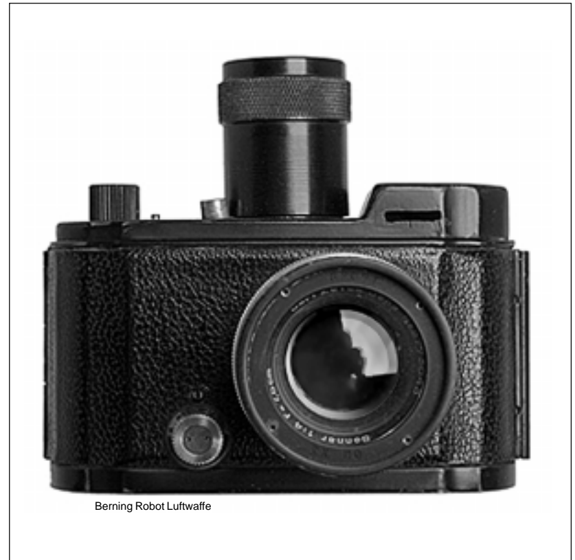
Berning Robot Luftwaffe